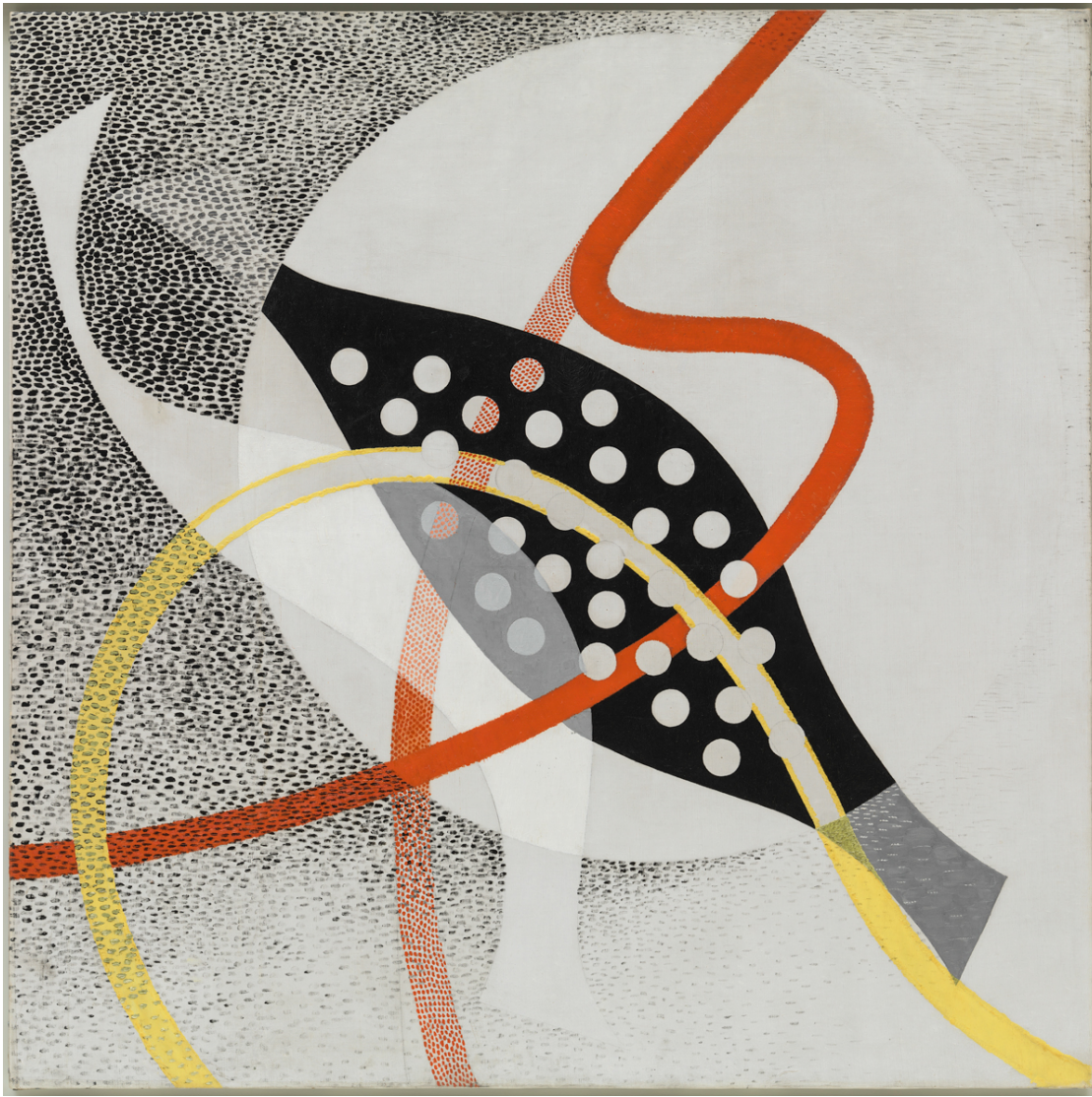
Construction AL6 (Konstruktion AL6), 1933–34. Oil and incised lines on aluminum, 60 × 50 cm.