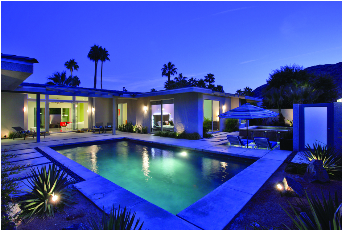
Landscape and Architecture are one in Palm Springs Modernism.