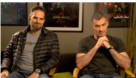
LA Weekly Talks John Wick 2 Stunts With Director Chad Stahelski