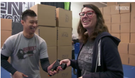
LA Weekly Takes You To Movie Stunt School