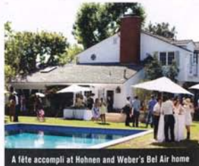
A fête accoupli at Hohnen and Weber's Bel Air home